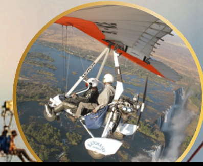
Wild Horizons Microlight Flight