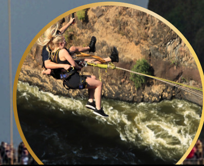
Wild Horizons Gorge Swing