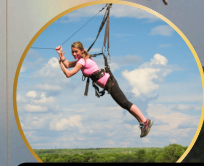
Wild Horizons Flying Fox