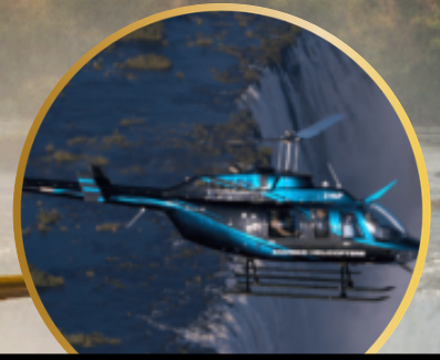
Wild Horizons Helicopter Flight