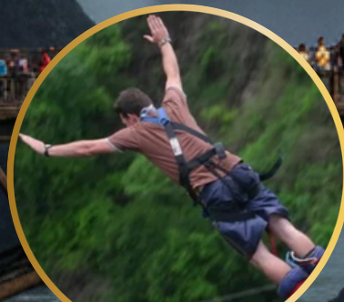
Wild Horizons Bungee Jump